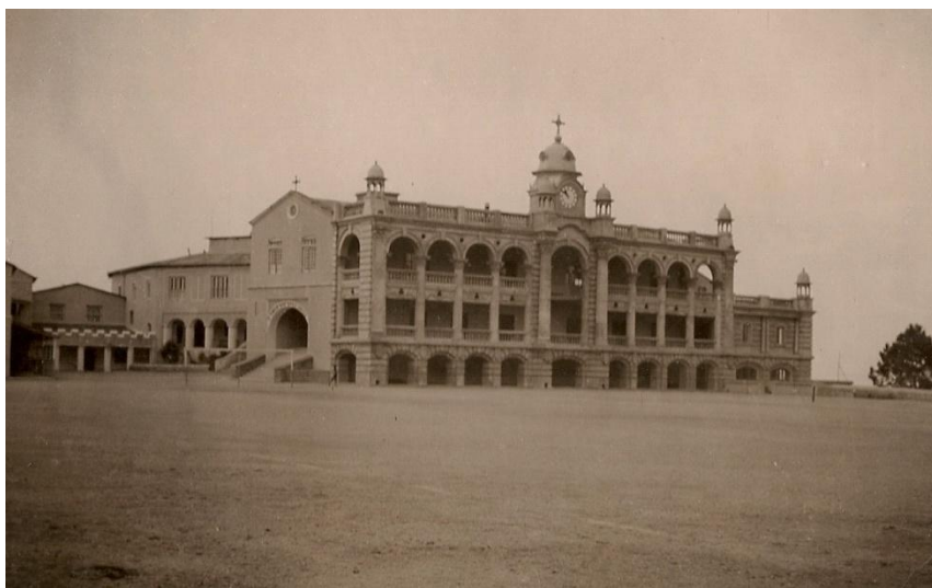
St George's College, Mussoorie. Document code: FSP/P/2/122.