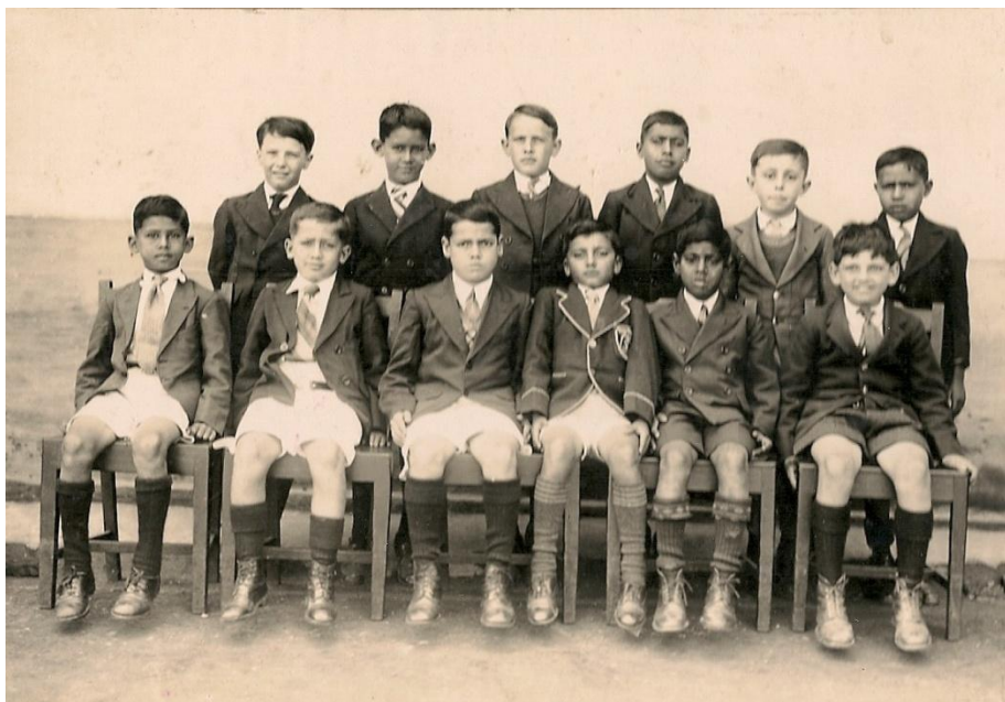
First Communicants, Coonoor, 1936. Document code: FSP/P/2/51.