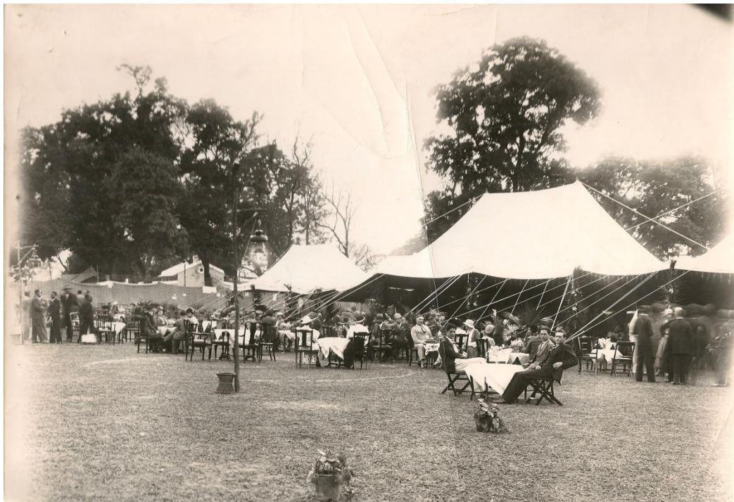
'At Home' day given by the Principal and staff of St Joseph's Academy, Dehra Dun, 19 March 1934. Document code: FSP/P/2/69.